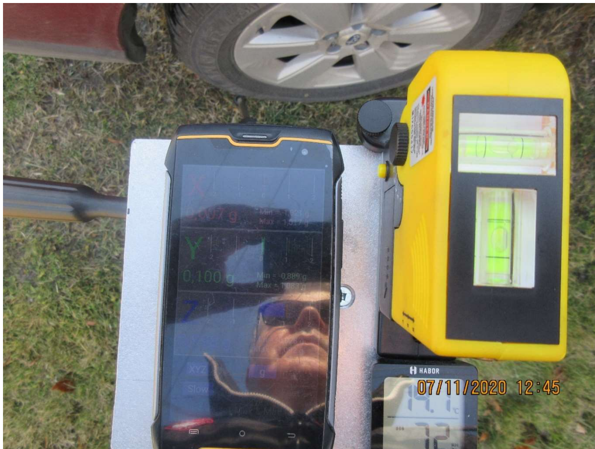
Fig. 5 – accelerometer data: X=0.07g; Y=0.100g; Z=0.998g

Along with the weighing experiment, a gravitational acceleration measurement in three axes was performed using the X-Y-Z accelerometer built-in a smartphone through an application interface called “Accelerometer”. During this second experiment, an acceleration of (0.100-0.105) g was displayed in the direction of the reactors, where “g” is the gravitational acceleration.