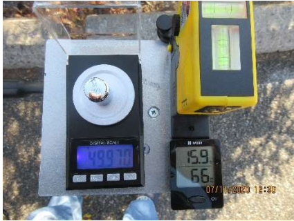
Fig. 2 - measured 49.970 g @ L1

The discrepancy between the measured weight and the calibrated weight is up to 10 times larger than the scale error. Therefore, the average 0.05% decrease of the test body weight is considered measurable and significant.