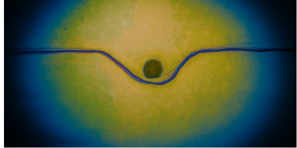
SIMPLE IMAGE OF THE STAR AND ITS CURVATURE IN THE SPACETIME