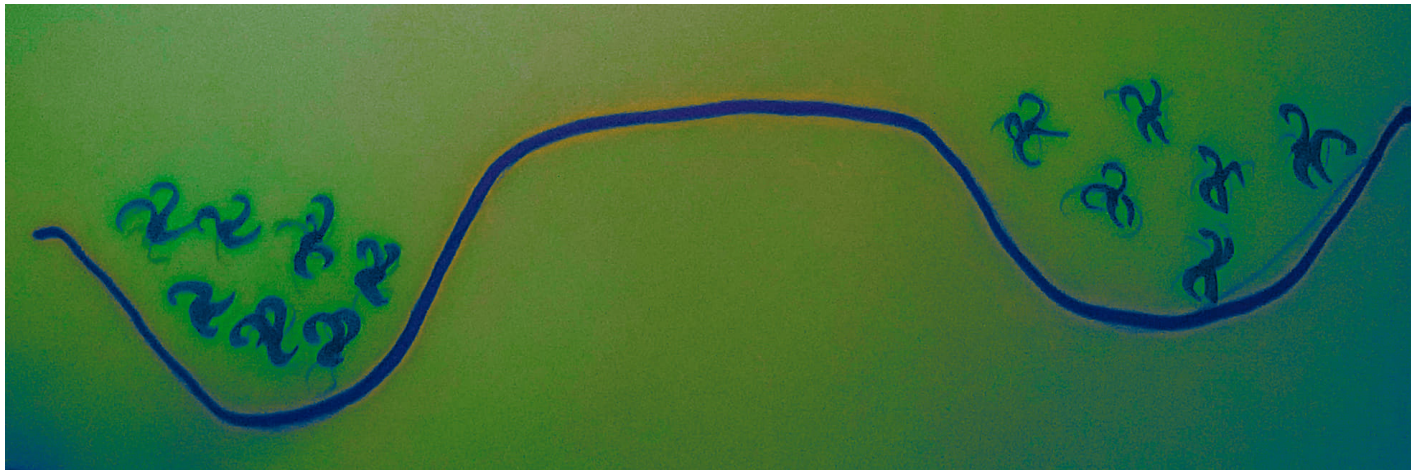
CLUSTERS OF GALAXY FAR APART