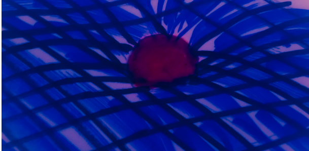
3D MODEL FOR THE CURVATURE OF SPACETIME

Image of the star bending spacetime in 2d sheet of paper