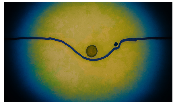
PLANET REVOLVING AROUND THE STAR