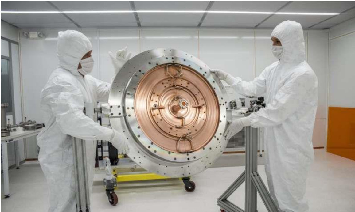
The LCLS-II electron gun in a Berkeley Lab clean room where it was assembled.

"The first generation of LCLS produced 120 X-ray flashes per second, which means the injector laser and RF power only had to operate at that rate," he said. "LCLS-II, on the other hand, will also have the capability of firing up to a million times per second, so the RF power needs to be switched on all the time and the laser has to work at the much higher rate."