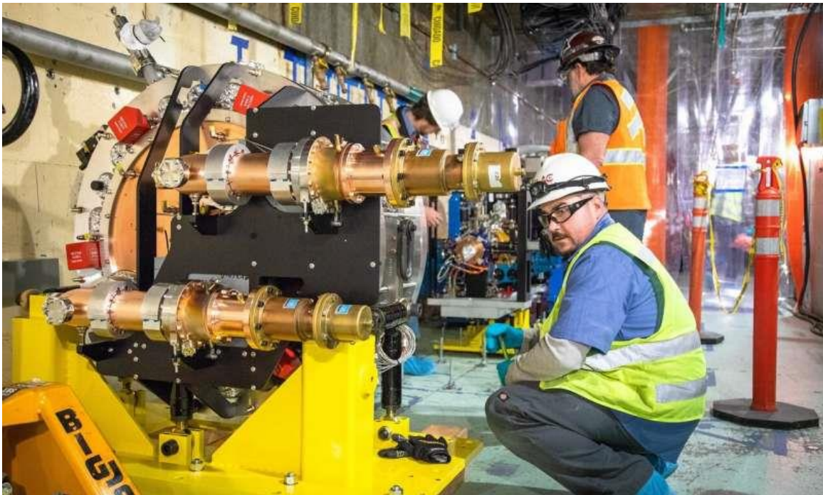
The LCLS-II electron gun being installed at SLAC.

"To produce electrons efficiently, we want to shine ultraviolet light onto the photocathode, but there is no commercial laser system capable of providing UV pulses with the unique properties required by LCLS-II at the rate of a million pulses per second," she said. "Instead, we send the light of an infrared laser through an optical system containing non-linear crystals that convert it into ultraviolet light. But because of the heat generated in the crystals, doing this conversion at such a high pulse rate is very demanding, and we're still in the process of optimizing our system for the best performance."